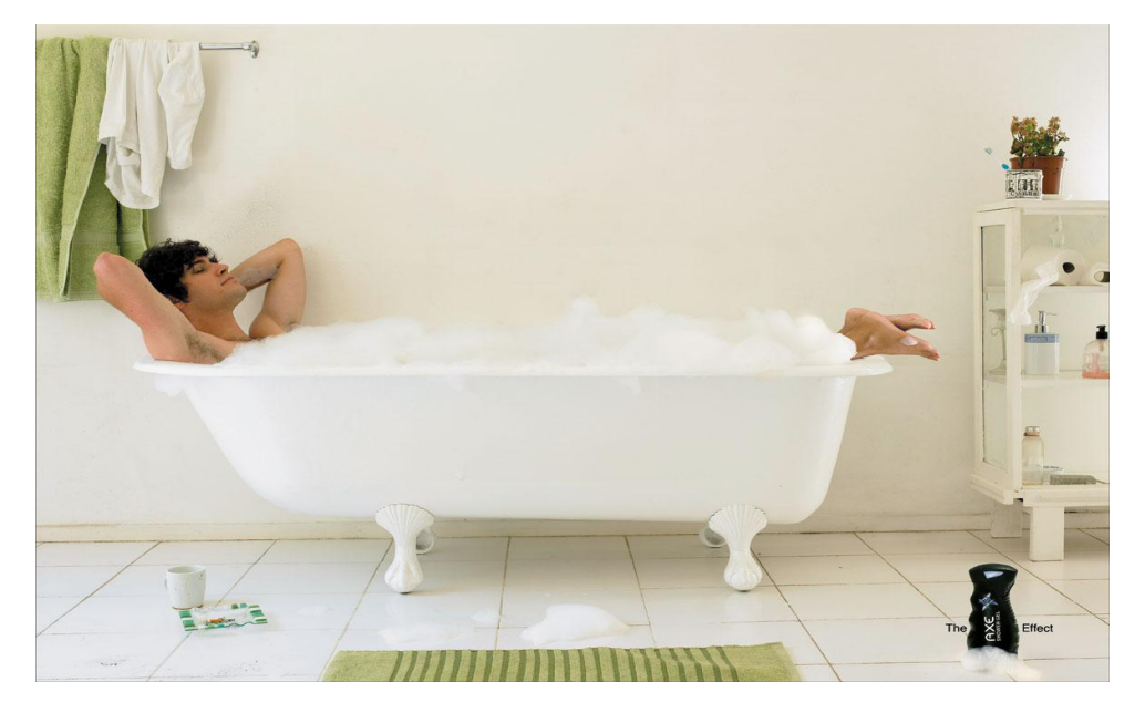
Fig.6 – Axe Advertisement

Despite the fact Axe brand offers several different fragrances, all its brand advertisement bring one cohesive sense of meaning: an explicit idea that Axe smells can irresistibly attract women, setting man free from all approach, convincement or seduction efforts. In these circumstances, Axe man is quite the opposite of classic seductive conqueror, he adopts a position of submission and passivity while woman owns the active and dominator character. This roles inversion gives man a condition of comfort and security because it spares him of shameful possibilities to be disclaimed and rejected. Once woman desires and search him with no shyness man has nothing to worry about neither reason to feel insecure, so his safety needs are attended and satisfied. Sexually confident and shameless women had always been in men imagination: In literature the most knew examples, even though in an implicit way are King Arthur of Camelot and Samson controlled by Delilah in Bible. Masculine fetish of domination by women own the form of the Police woman, the nurse, the school teacher, the beautiful boss and so many other representations in pornography industry; Brazilian Media gives space to personages like Tiazinha,