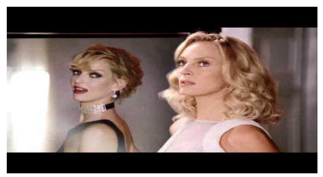
Fig. 8 – The actress Uma Thurman in a scene from commercial movie "Ange ou demon – Le secret"

The duplicity and ambiguity character is not only in the name of the perfume Angel or Demon. It flags all marketing communication about this product for a target capable of hiding or revealing its sexuality as convenient. Ange ou Demon women have an ability to take turns between the Angel and the demon inside themselves, demonstrating a trusty image to the world and another only knew by herself or those she chooses to show.