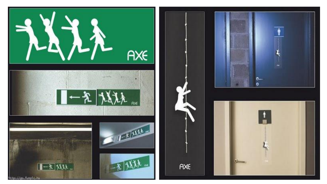
Fig. 4 –Axe advertisement placed on men restroom plaques