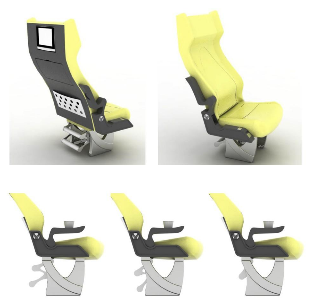
Figure 2. Design Proposal 2