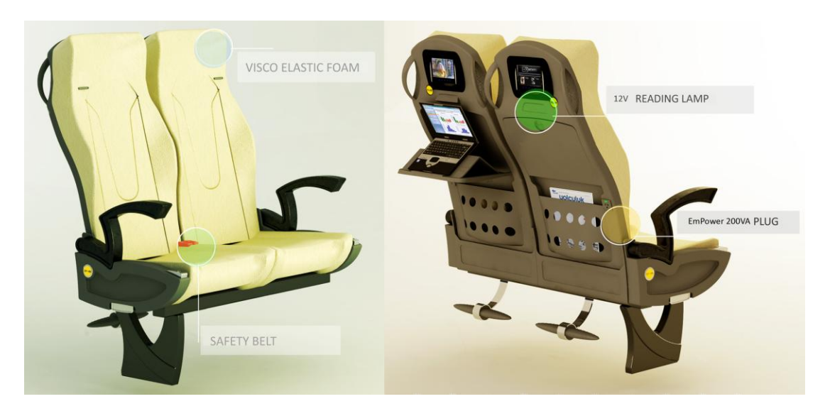
Figure 5. Final Proposed Concept