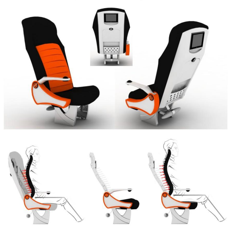
Figure 3. Design Proposal 3

Dealing with the approaches that the company has indicated various challenges, the design team came together to make an estimate of the situation. Analyzing the report prepared by the company, the final design phase is conducted in the light of the predictions and suggestions by an eclectically approach. The solutions that are criticized positively are combined together for constituting the product.